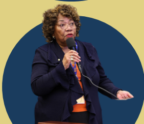
Senator Geraldine Thompson's amendment would have allowed an exemption for women under threat of domestic violence.

Here's a reminder of some of the amendments filed by Senate Democrats that were rejected by Republicans :