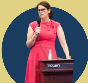
Senator Tina Polsky's amendment would have allowed for a religious exemption.