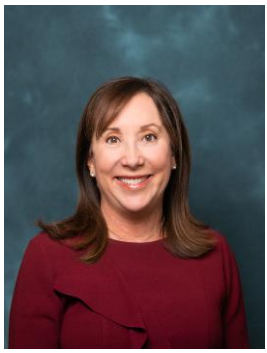
STATE SENATOR LORI BERMAN Senate Democratic Whip

THE OFFICAL PUBLICATION OF SENATE DISTRICT 31