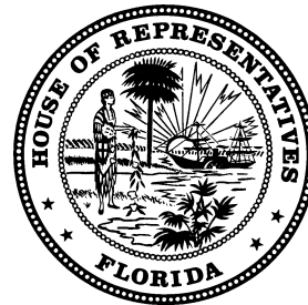
THE FLORIDA HOUSE OF REPRESENTATIVES