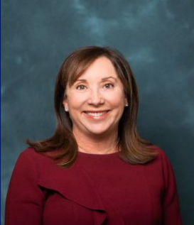
STATE SENATOR LORI BERMAN Senate Democratic Whip

THE OFFICIAL PUBLICATION OF SENATE DISTRICT 31