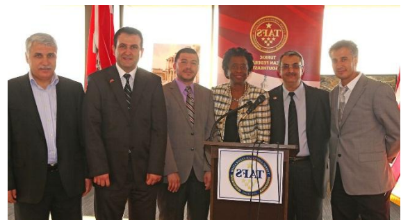
Members of the Turkic America Federation of Southeast and Senator Joyner