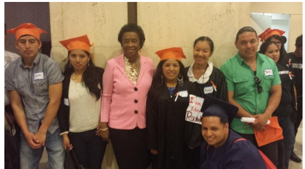
Senator Joyner and students from Dream University - a group of FL students who rallied and lobbied the legislature for the passage of SB 851.