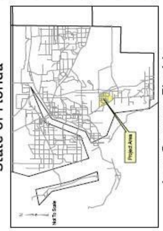
Lee County, Florida