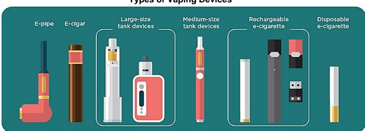
Types of Vaping Devices<sup>5</sup>

Vaping is the act of inhaling and exhaling an aerosol, or vapor, created from a liquid heated up inside of a battery-operated electronic device. There are various types of liquids and electronic devices used in vaping. Examples of vaping devices include vape pens, e-cigarettes, e-hookahs, electronic nicotine delivery devices, tank systems, and mods, all of which generally consist of a mouthpiece, a battery, a cartridge for containing the liquid, and a heating component which turns the liquid into an aerosol. Some devices are made to look like regular cigarettes, cigars, or pipes, while some are made to resemble pens, USB sticks, or other everyday items. The liquids used in vaping devices are generally combinations of propylene glycol or a glycerin-based liquid, nicotine, and flavoring chemicals.