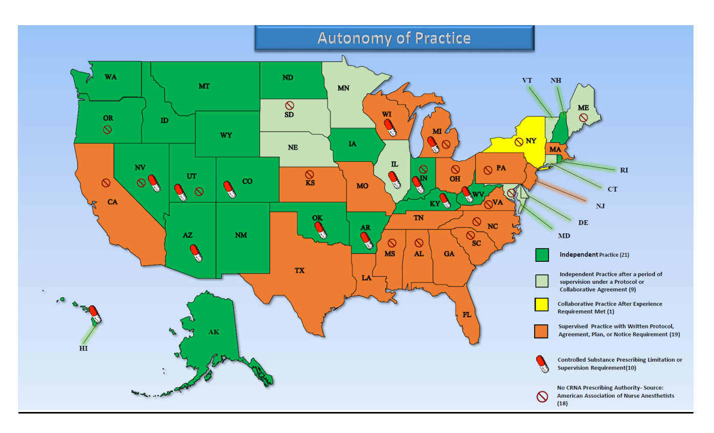
APRN Autonomy in Veterans Health Administration Facilities

The U.S. Department of Veterans Affairs (VA) adopted a rule in December 2016, which permits APRN full practice authority. <sup>50</sup> Under the rule, an APRN working within the scope of his or her VA employment is authorized to perform specified services within the scope of his or her training, education, and certification without the clinical oversight of a physician, regardless of state law restrictions. However, the rule expressly provides that the full practice of an APRN is subject to state law with regard to the prescribing or administration of controlled substances. The rule is limited to CNPs, CNMs, and CNSs, and does not apply to CRNAs. In Florida, 59 VA medical centers and health care clinics are affected by this policy change. <sup>51</sup>