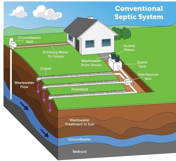
Please note: Septic systems vary. Diagram is not to scale.

Onsite sewage treatment and disposal systems (OSTDSs), commonly referred to as "septic systems," generally consist of two basic parts: the septic tank and the drainfield. Waste from toilets, sinks, washing machines, and showers flows through a pipe into the septic tank, where anaerobic bacteria break the solids into a liquid form. The liquid portion of the wastewater flows into the drainfield, which is generally a series of perforated pipes or panels surrounded by lightweight materials such as gravel or Styrofoam. The drainfield provides a secondary treatment where aerobic bacteria continue deactivating the germs. The drainfield also provides filtration of the wastewater, as gravity draws the water down through the soil layers. 91