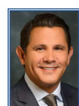
PIZZO (D) DISTRICT 37 SUNNY ISLES BEACH