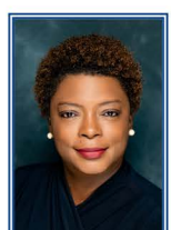
DAVIS (D) DISTRICT 5 JACKSONVILLE