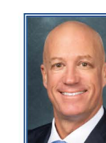
DICEGLIE (R) DISTRICT 18 INDIAN ROCKS BEACH