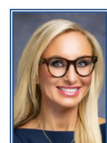
BOOK (D) DISTRICT 35 DAVIE MINORITY LEADER