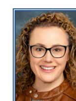
GRALL (R) DISTRICT 29 VERO BEACH