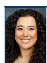
CALATAYUD (R) DISTRICT 38 MIAMI