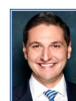
BURGESS (R) DISTRICT 23 ZEPHYRHILLS