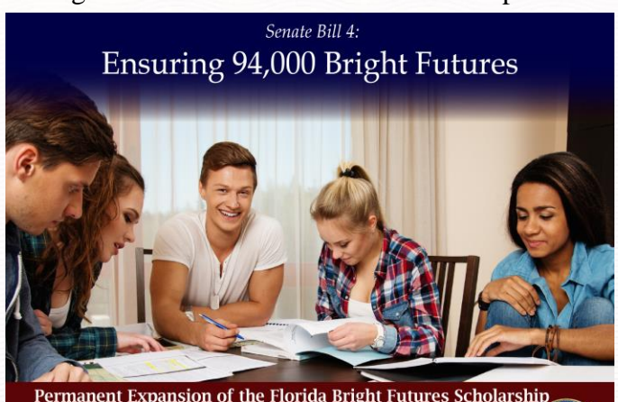
Permanent Expansion of the Florida Bright Futures Scholarship ACADEMIC SCHOLARS - 100% of tuition and fees plus $300 book stipend for fall and spring semesters MEDALLION SCHOLARS - 75% of tuition and fees

This legislation will provide the policy and budget resources our universities need to increase their ability to compete as national destination institutions, while preserving access and increasing affordability for Floridians. From the permanent expansion