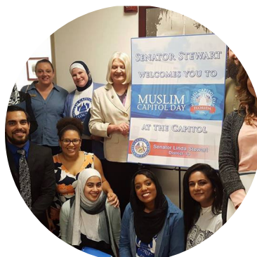
Constituents visit for Muslim Capitol Day