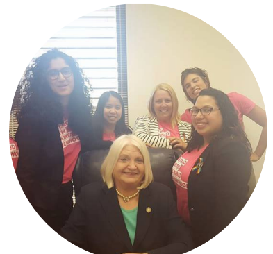
Standing with Planned Parenthood