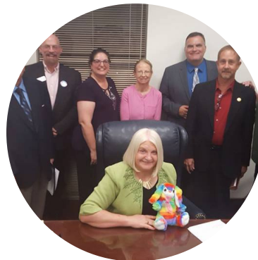
With LGBTQA constituents just before Easter