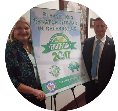
With Congressman Darren Soto for Earth Day