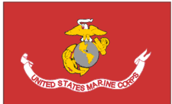
United States Marine Corps Flag