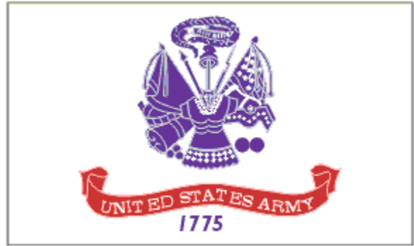
United States Army Flag