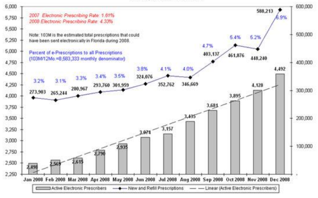
Source: SureScripts-RxHub, cited in , Agency for Health Care Administration, ePrescribing Clearinghouse, ePrescribing Dashboard 2008 Metrics.

Electronic Prescriptions and Electronic Prescribing Healthcare Providers, January to December 2008