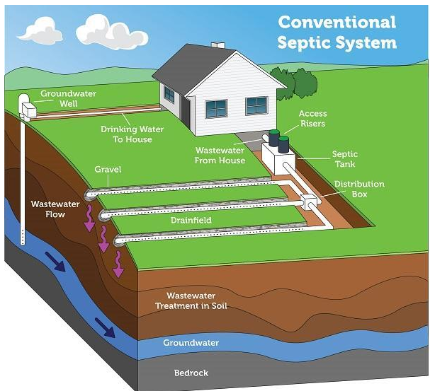
Please note: Septic systems vary. Diagram is not to scale.

anaerobic bacteria break the solids into a liquid form. The liquid portion of the wastewater flows into the drainfield, which is generally a series of perforated pipes or panels surrounded by lightweight materials such as gravel or Styrofoam. The drainfield provides a secondary treatment where aerobic bacteria continue deactivating the germs. The drainfield also provides filtration of the wastewater, as gravity draws the water down through the soil layers.<sup>91</sup>