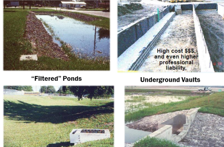
"Dry" Retention Ponds

The DEP's stormwater rules are technology-based effluent limitations rather than water qualitybased effluent limitations.<sup>123</sup> This means that stormwater rules rely on design criteria for BMPs to achieve a performance standard for pollution reduction, rather than specifying the amount of a specific pollutant that may be discharged to a waterbody and still ensure that the waterbody attains water quality standards.<sup>124</sup> The rules contain minimum stormwater treatment performance standards, which require design and performance criteria for new stormwater management systems to achieve at least 80 percent reduction of the average annual load of pollutants that would cause or contribute to violations of state water quality standards.<sup>125</sup> The standard is 95 percent reduction when applied to Outstanding Florida Waters. In 2007, an evaluation performed for the DEP generally concluded that Florida's stormwater design criteria failed to consistently meet either the 80 percent or 95 percent target goals in the DEP's rules.<sup>126</sup> The images shown here depict six major types of surface water management systems:<sup>127</sup>