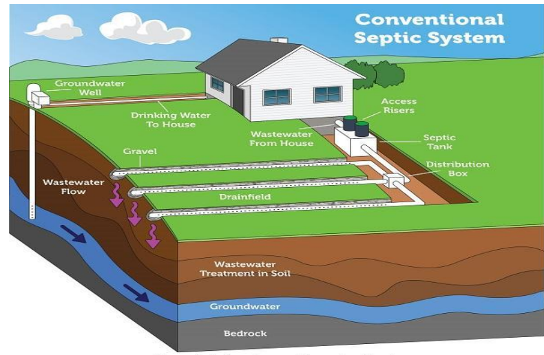
Please note: Septic systems vary. Diagram is not to scale

The Blue-Green Algae Task Force recommended that DEP should develop a more comprehensive regulatory program to ensure that OSTDSs are sized, designed, constructed, installed, operated, and maintained to prevent nutrient pollution, reduce environmental impact, and preserve human health. The task force also recommended more post-permitting septic tank inspections. <sup>10</sup>