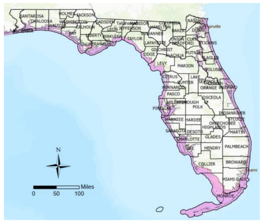
Projection of 2 ft. Sea Level Rise<sup>12</sup>

Over five million structures are estimated to be affected by flooding under a two-foot sea level rise scenario. The estimated value of these at-risk properties exceeds $576 billion.<sup>13</sup>