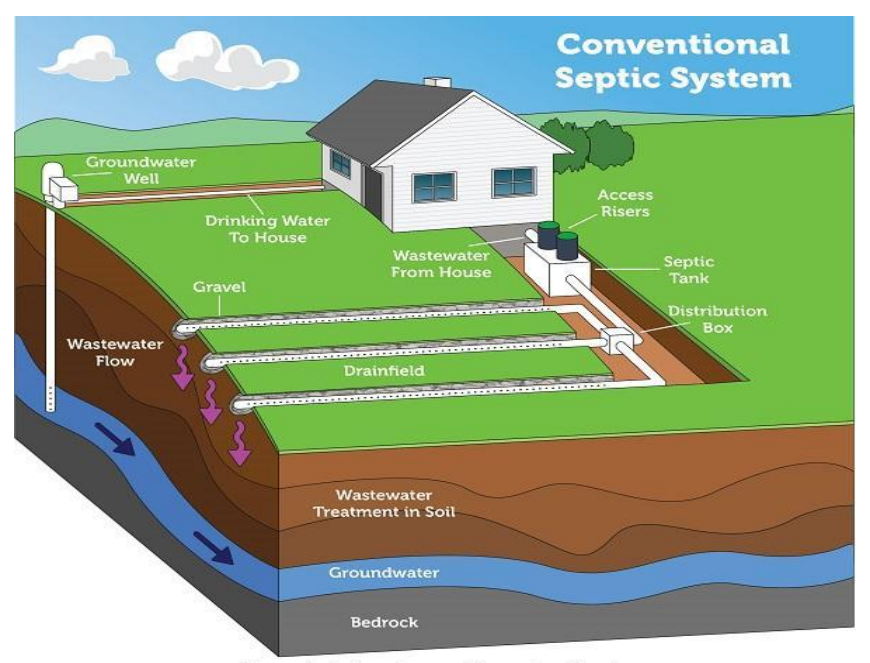
Please note: Septic systems vary. Diagram is not to scale.

OSTDSs, commonly referred to as "septic systems," generally consist of two basic parts: the septic tank and the drainfield. Waste from toilets, sinks, washing machines, and showers flows through a pipe into the septic tank, where anaerobic bacteria break the solids into a liquid form. The liquid portion of the wastewater flows into the drainfield, which is generally a series of perforated pipes or panels surrounded by lightweight materials such as gravel or Styrofoam. The drainfield provides a secondary treatment where aerobic bacteria continue deactivating the germs. The drainfield also provides filtration of the wastewater, as gravity draws the water down through the soil layers. <sup>27</sup>