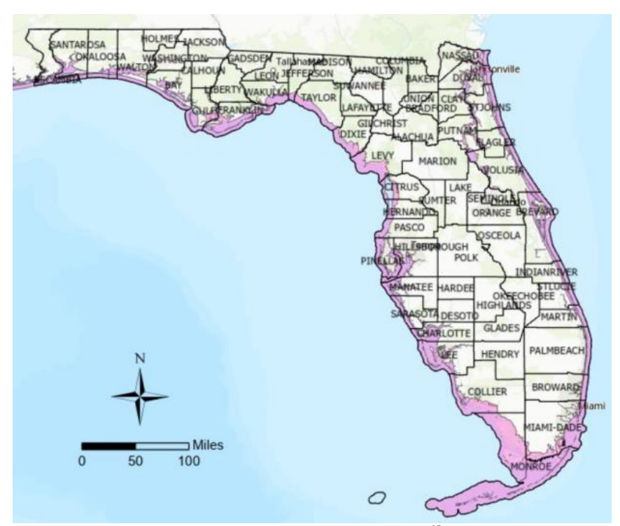
Projection of 2 ft. Sea Level Rise<sup>65</sup>

Over five million structures are estimated to be affected by flooding under a two-foot sea level rise scenario. The estimated value of these at-risk properties exceeds $576 billion.<sup>66</sup>