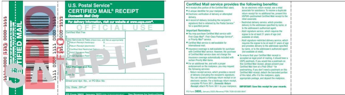
PS Form 3800, Certified Mail Receipt (front and back) 4

With respect to the “certified mail” component of registered mail, the U.S. Postal Service will provide the sender (if requested, and for a small fee), 2 a mailing receipt (PS Form 3800, Certified Mail Receipt) as confirmation that an item was sent. Although certified mail does also require a signature from the recipient, it does not provide the sender a return receipt with proof of signature, unless that service is separately requested (see below). 3