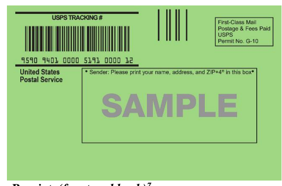
PS Form 3811, Domestic Return Receipt (front and back)<sup>7</sup>