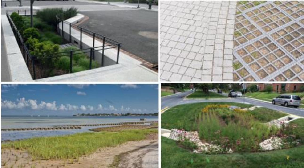
Stormwater Planter, Permeable Pavement, Living Shoreline, and Bioretention 9